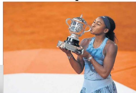
Coco Gauff of the U.S. kisses the trophy after winning the final match of the French Open against Aryna Sabalenka at the Roland Garros stadium in Paris on Saturday.

Coco Gauff handles bad memories and top-ranked Aryna Sabalenka to earn her first French Open title. PARIS — Depending on the painful memory of her defeat three years ago in the French Open final great Coco Gauff just the motivation she needed even before stepping onto Court Philippe-Chatrier. The 23-year-old American defeated top-ranked Aryna Sabalenka 7-5(6), 6-4 on Saturday to win her first Grand Slam title, two years after winning the U.S. Open. "I think (the U.S. Open victory) is a great consolation but this one was harder," said Gauff, who managed to handle the pressure and the momentum swings better than Sabalenka. "I knew it was going to be about will power and mental strength." The victory put to rest the bad memories of her 2022 French Open final loss to Iga Swiatek when, as an 18-year-old, Gauff fell overwhelmed even before stepping onto Court Philippe-Chatrier. "It was tough time, I was doubting myself," Gauff recalled. "I was crying before the match, and so nervous, literally couldn't breathe and stuff." Gauff said that the hospital has rocked her confidence to such an extent that she was left "in a dark place" and found she was not cut out for winning major titles.